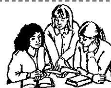
Ladies' Bible Study

Call Linda Sites (909) 599-8051, if you are interested in joining us.