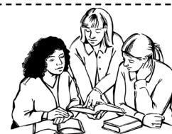
Ladies' Bible Study

Women's Bible Study is being held in Laird Hall every Tuesday morning from 9:00-11:00.